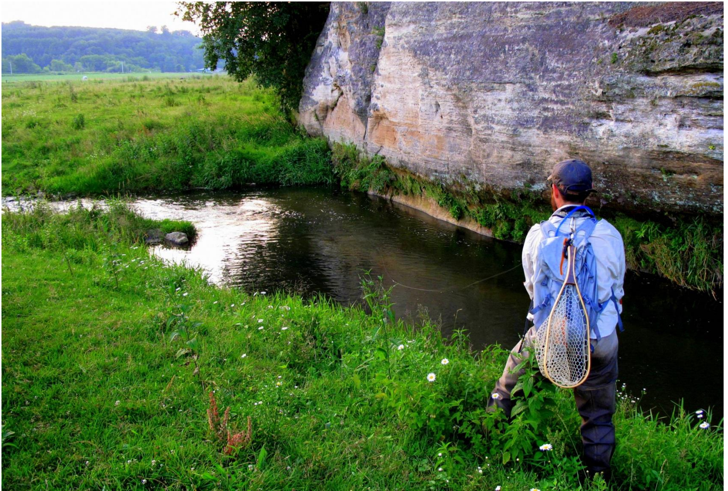
Trout fishing on Willow Creek