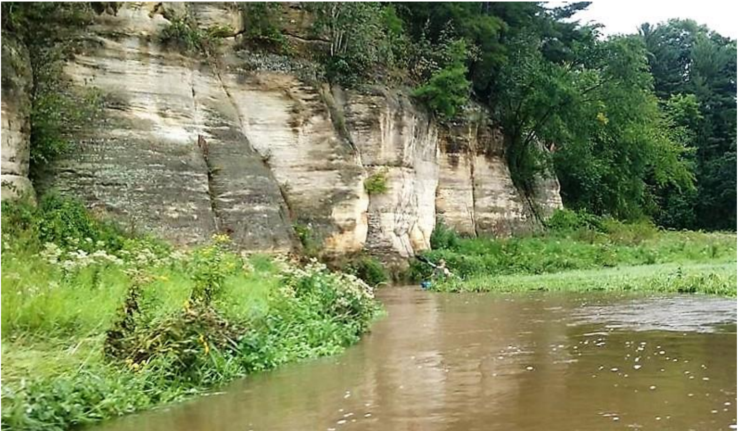
Pine River Paddle & Tube.

You will find parking at Hollow Road and also at Smyth Hollow Road, both of which are off Highway 58. There are rumors that large brood-stock rainbows have been released into Willow Creek, but otherwise, you should expect to catch native brook and wild brown trout. The first tributary to Willow Creek is the Little Willow on Highway NN. Other spots to try are Smith Hollow, Lost Hollow, Wheat Hollow, Jacquish Hollow and Happy Hollow.