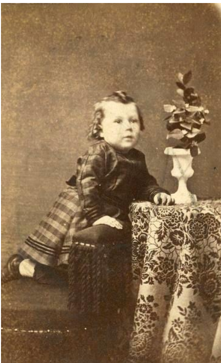
Frank Lincoln Wright, age 3.