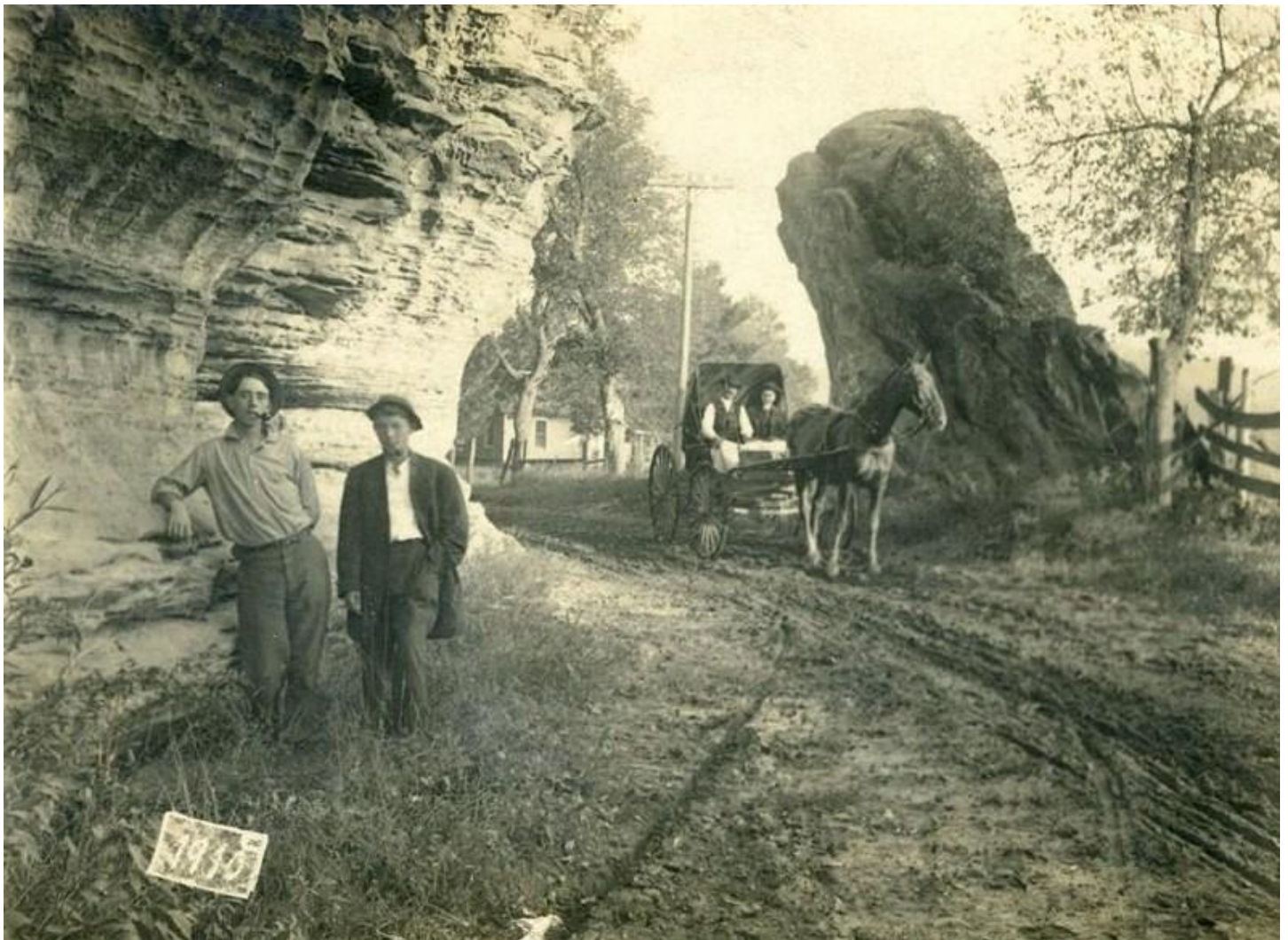
The original route of County Hwy D west of the village of Rockbridge.

and interesting. Among the more prominent natural features of interest is the rock bridge spanning the Pine River. Immense ledges of rock, forming sometimes a perpendicular wall of great height, rise abruptly from the highway, and springs of water flow from the hills furnishing numerous streams. Formerly this township was abundantly supplied with a heavy growth of excellent timber, but the original forests have been reduced by the ax in the early settlement days until the large pines became scarce.