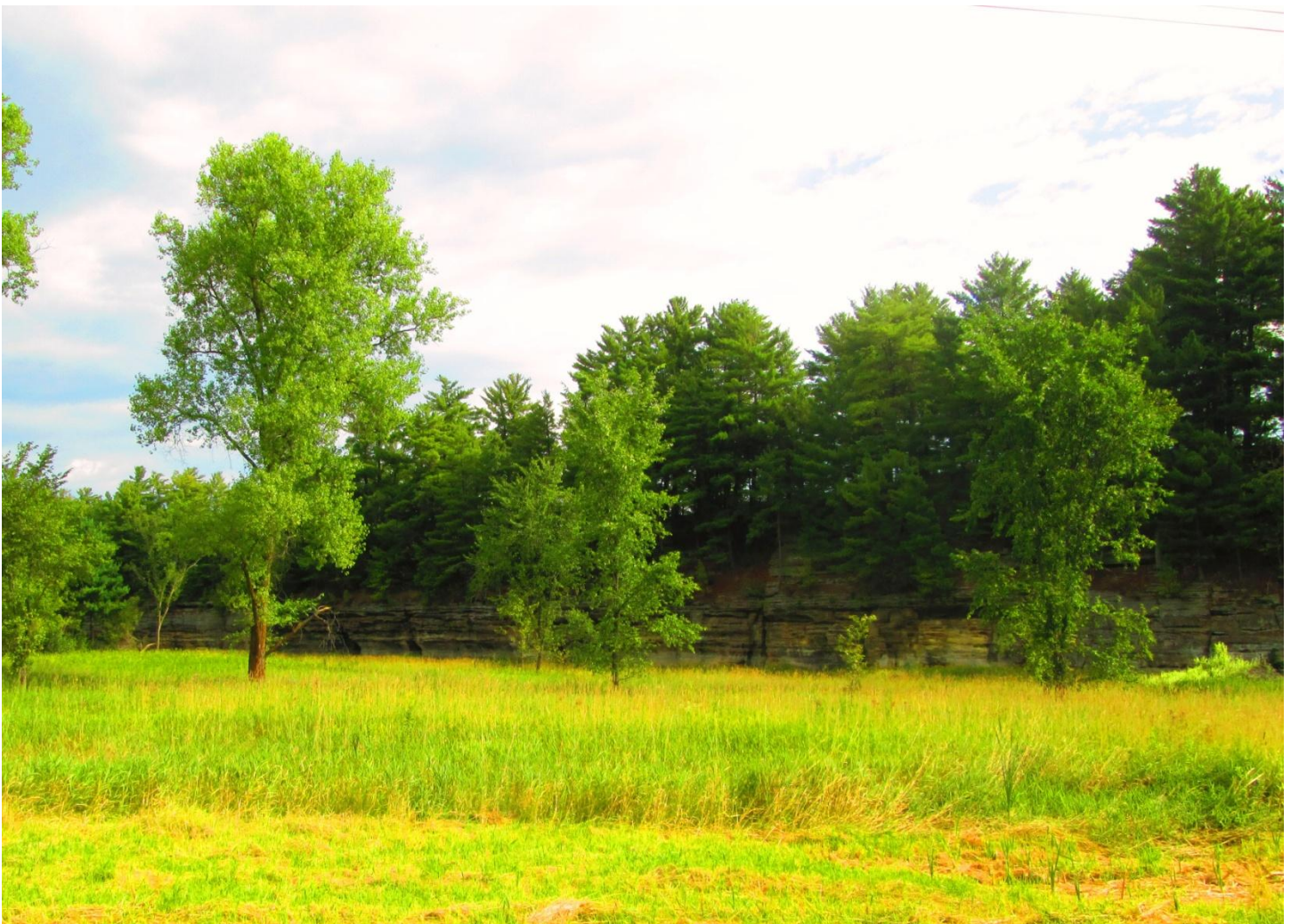
The west side of Pier Natural Bridge Park on CTY Hwy D.